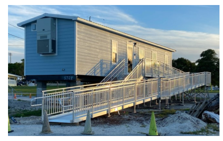
Actual modular now in place

The cost is coming out of the marina revenues.